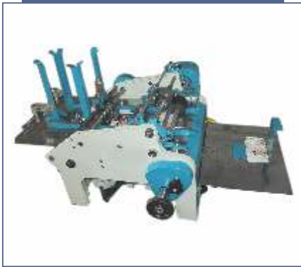
Batch Coding for Label